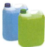
Windshield washer fluid & Antifreeze