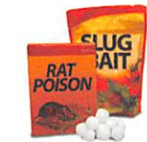
Moth balls, Rat/mouse poison, Some slug baits