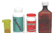
Prescription drugs, Ibuprofen, Acetaminophen, & Cold medicine