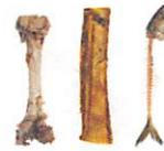
Chicken, Rib & Fish bones