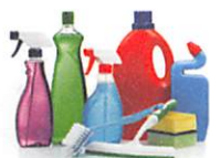
Household cleaning products