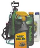
Some insecticide products