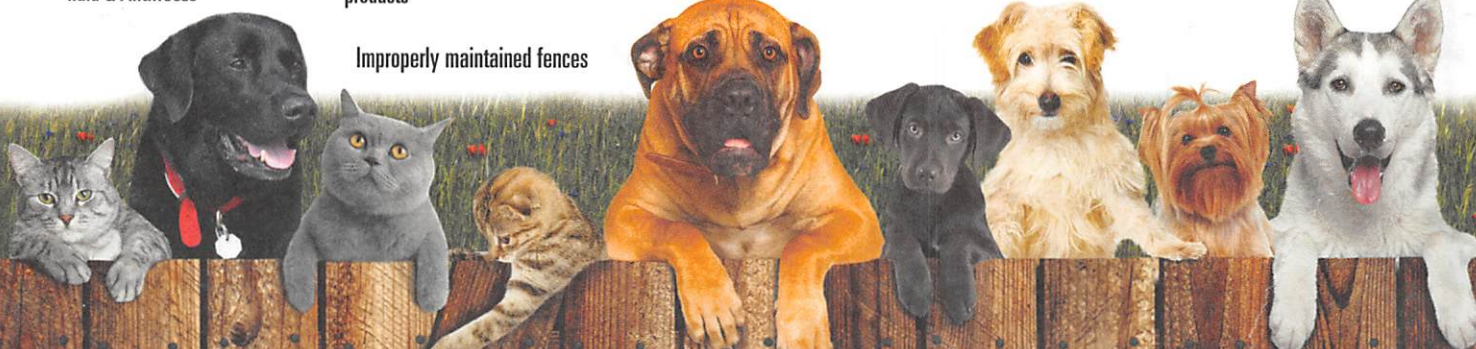
Improperly maintained fences