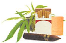
Tobacco products, Nicotine patch & Marijuana