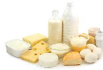
Raw eggs, Milk & Other, dairy products